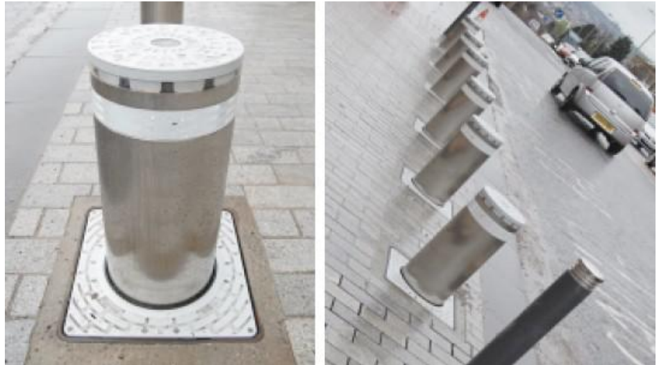
SSAB Automatic Rising Bollard

Security Solutions offers a complete turnkey solution from design to handover along with a comprehensive after sales support to meet your immediate and long term needs.